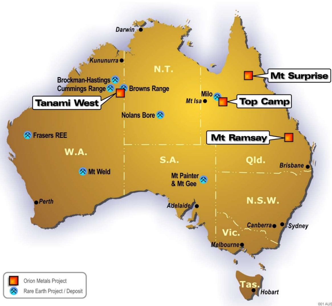
Figure 1: Project Location Map

Orion Metals tenement portfolio has not changed significantly in the 12-month period to February 2018. However, post the reporting period, in May 2018, the Mt. Surprise Project tenement EPM 18449 expired. Also, in May 2018, the Top Camp Project tenements, ML 2785 and ML 2792 were renewed by the Queensland Department of Natural Resources and Mines (DNRM).